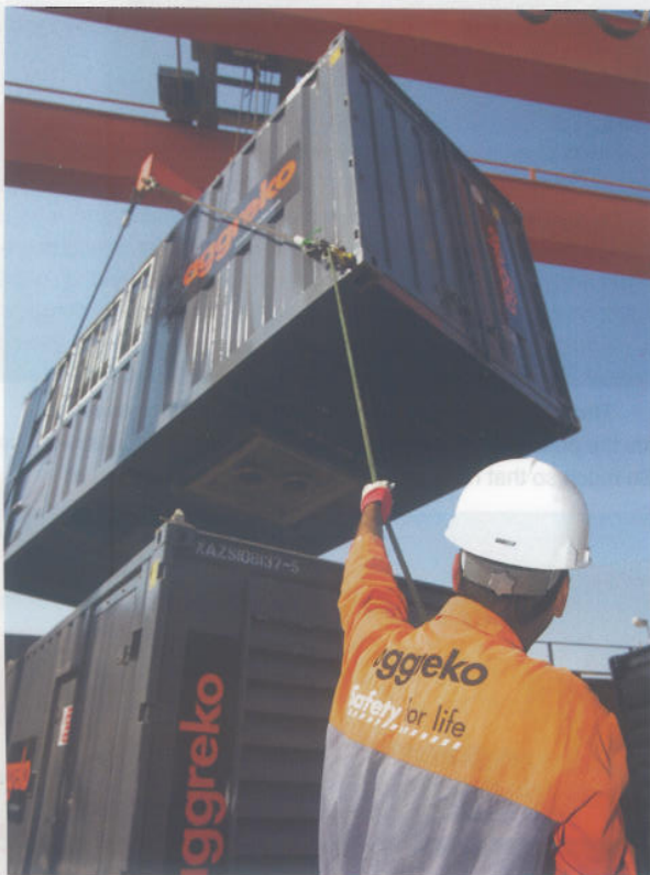
Mobilising Aggreko gas generators.

The highest profile contract Aggreko's local business division was awarded in Africa was to supply backup power to the International Broadcasting Centre (IBC) at Soccer City, for the Fifa world cup, as well as for the broadcasting facilities at the ten world cup stadia. The contract entailed the supply of 30 MW of standby power, as well as 300 km of cable. Half the gensets provided were 1,250 kVA units and the rest were 800 kVA units. Of the total, 16 MW were provided for IBC itself where the load was not expected to exceed 8.0 MW, and realistically Soames says he would be surprised if it exceeded