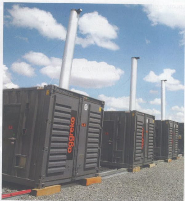
Aggreko's power project in Embakasi, Kenya.

Soames says, "We use gas as a fuel wherever it is available as it is usually the cheapest option. Four years ago