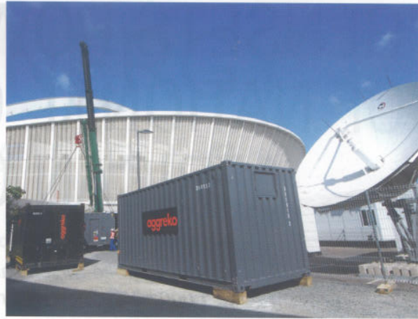
Power for broadcasting.

Aggreko also has a large contract in Uganda where it is providing temporary power while the new Bujagali hydroelectric