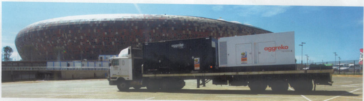
Aggreko provided power solutions for the Fifa world cup in South Africa.

The units are 1,250 kVA modules and Soames says this fits the philosophy that everything is done in 20 ft containers. So much so that he jokes, "If you were to stand around at